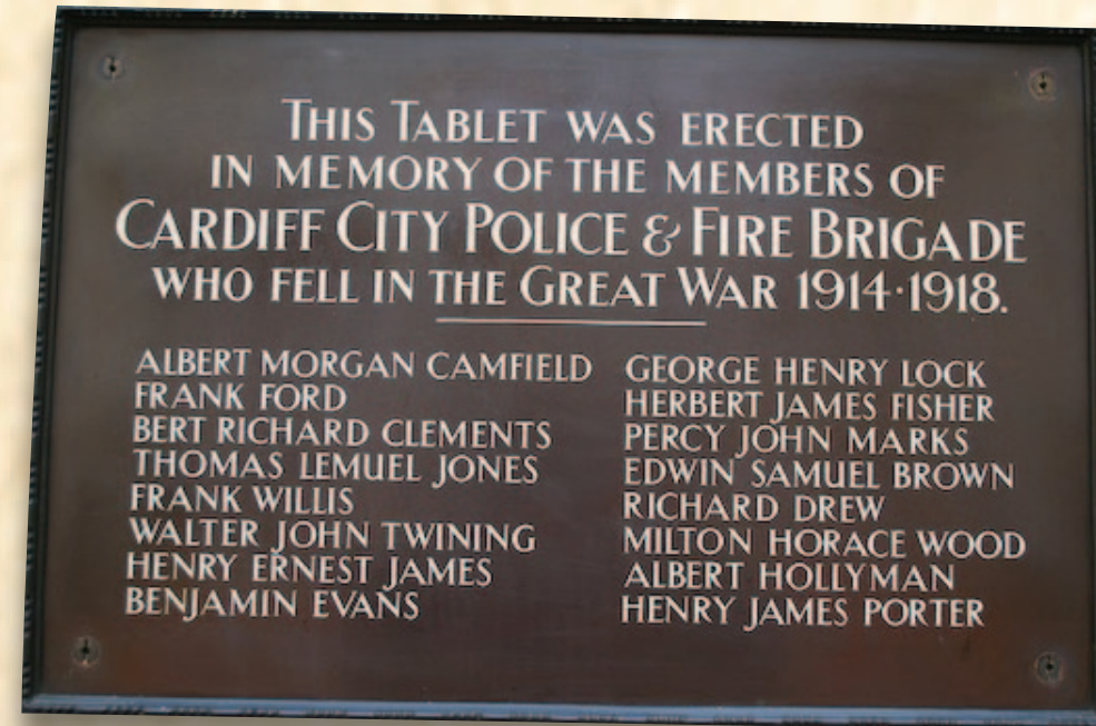
Memorial Plaque at Cardiff Bay Police Station

A police force for the then Borough of Cardiff was formed in 1836. In 1905 it became the Cardiff City Police following the grant of city status to Cardiff. During the First World War sixteen of its policemen died, seven of them during the early fighting in 1914. They are all remembered on a Memorial Plaque in today's Cardiff Bay Police Station.