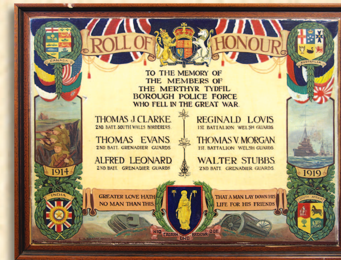
Merthyr Borough Police Memorial Panel

The Borough of Merthyr was created in 1908 and it then formed its own police force, the area having previously been policed by the Glamorgan Constabulary. Six members of the force died during the First World War. They are remembered on a Memorial Panel at the Merthyr Police Station.