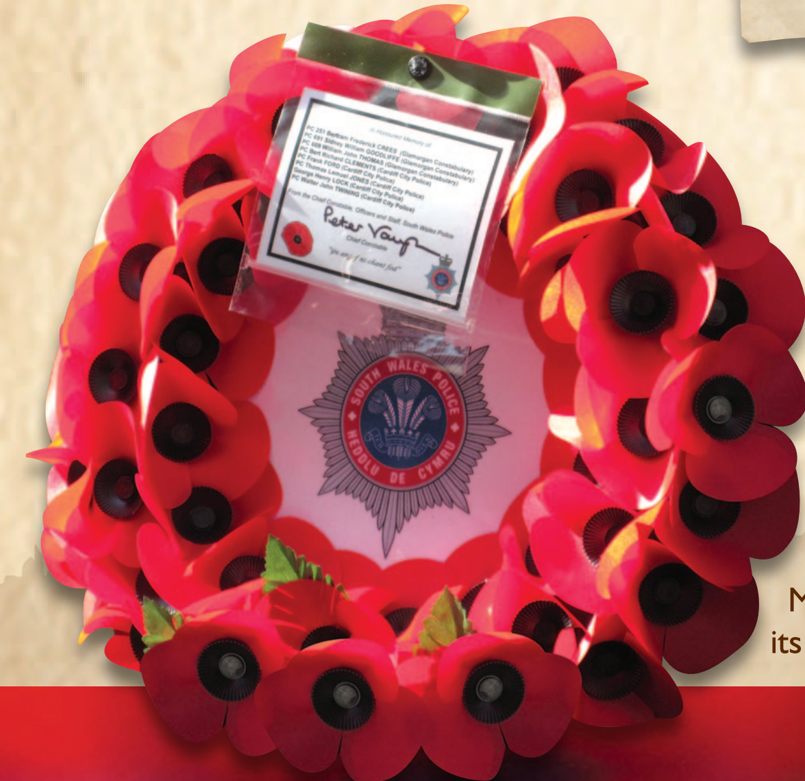
South Wales Police wreath at the Menin Gate Memorial, Ypres, remembering police officers from its predecessor forces commemorated there