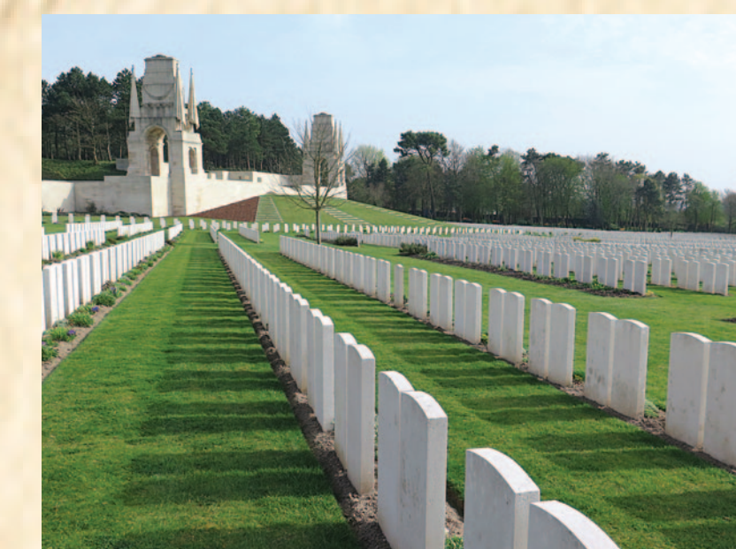
The Cemetery at Etaples in France where PC Thomas Voyle Morgan is buried