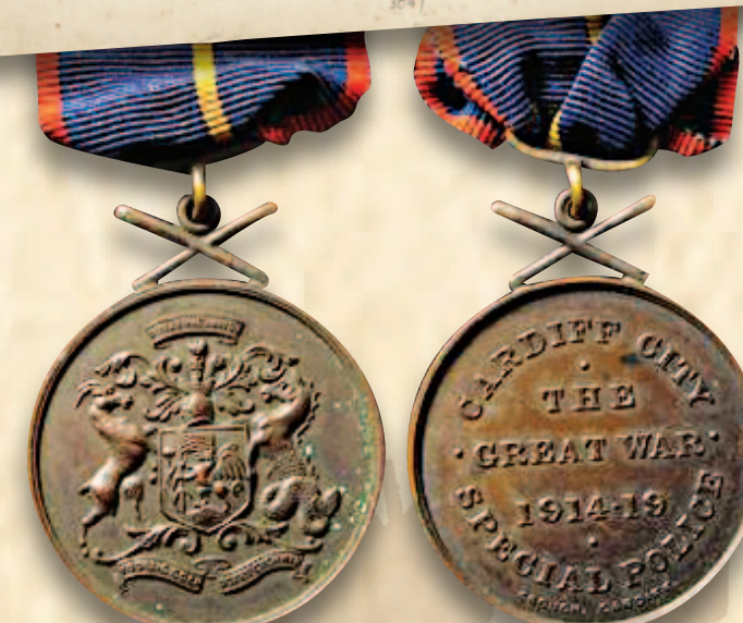
Special Constable's war service certificate and medal