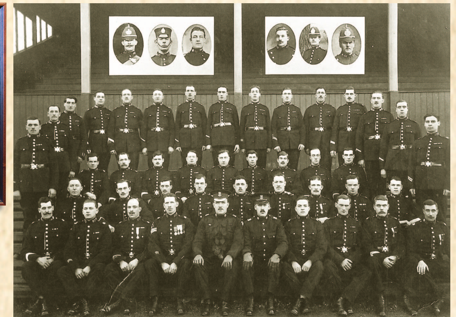
The Merthyr Borough policemen who served during the First World War